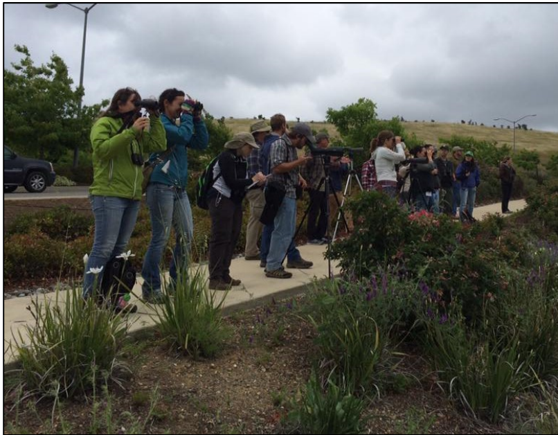
Over 50 attendees were able to participate in the Wednesday or Thursday Field sessions to visit Tricolored Blackbird colonies in different stages of nesting, allowing attendees to apply the survey techniques learned in the Classroom session.

Tricolored Blackbird Workshop information can be found at our Past Events page here , including the workshop materials, list of Tricolored Blackbird references and other information, such as TWS Certification credits.