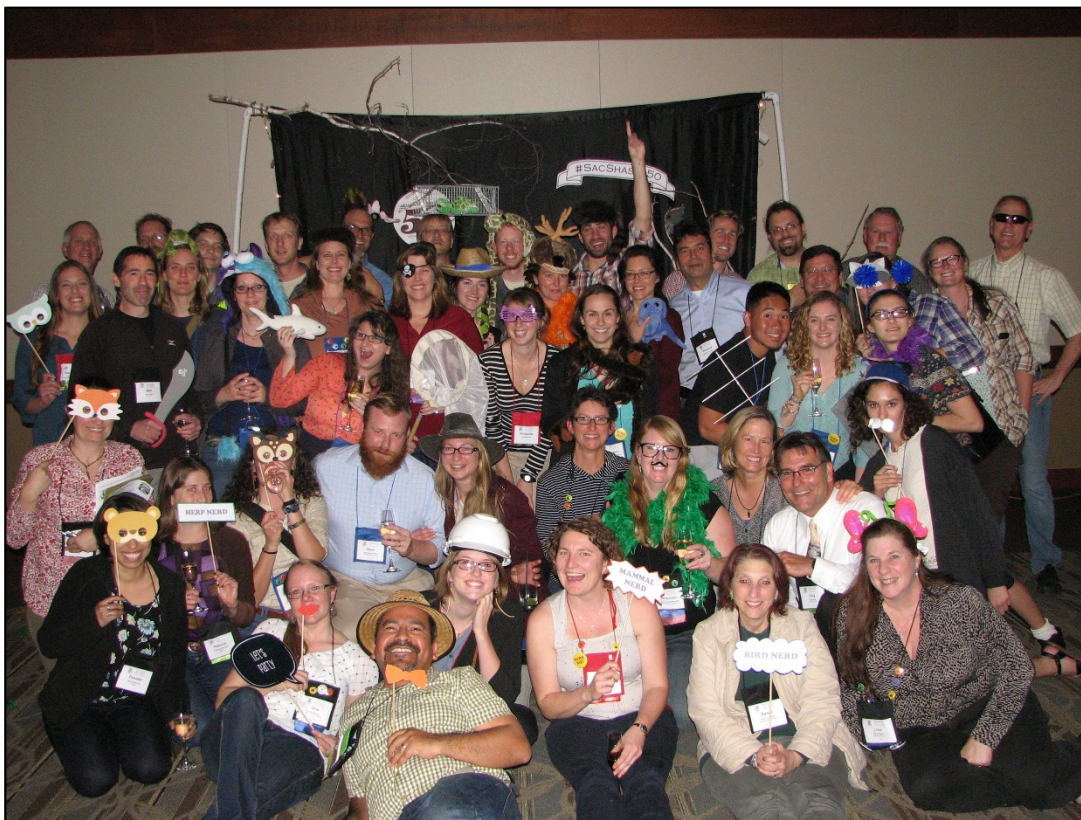
Nearly 50 Sac-Shasta Chapter and other TWS chapter members helped us kick off our anniversary celebration at the Western Section Annual Meeting in Pomona, took some silly photos at our photobooth, and enjoyed great conversation by students and professionals alike.

The Annual Chapter Meeting at the 2016 Western Section Conference occurred at the end of February. Board members reported that the Paypal swipepad used work well and it was decided that the board should look into getting two swipepads. Our chapter was recognized for our 50 th anniversary, which had a special celebration organized by the board. Photos were shared via the chapter's Google Drive and at our website. The photo booth was a success and everyone seemed to enjoy it.