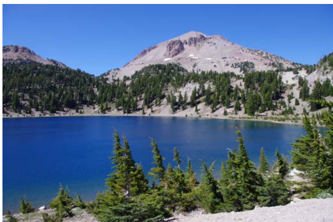
Lassen Peak with Lake Helen in the foreground.

UC Davis student-professional mixer ( April or May ); additional brown-bag seminars throughout the year; restoration projects; birding with an avian specialist and BBQ at Cosumnes River Preserve (May) ; Spring Mixer in the southern area of the Chapter ( May ); Fall Mixer in the Chico area ( August or September ); River float and BBQ in the northern region ( July or August ); camping trip at Lassen Volcanic National Park , with short group activities (e.g., GPS/compass/map reading) and time to hike, bird, botanize, and enjoy the beauty of the park ( August or September ); and an Eagle workshop in the fall/winter .