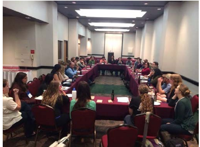
Over 30 Sac-Shasta new and existing members gave input to members of the 2014 board at the members meeting Jan. 29 at the Annual Meeting in Reno.

personally benefitted from. The conference was followed by two days of tracking workshops, wilderness first aid and others at Sagehen Field Station outside Truckee. Hope to see you at the 2015 Annual Conference at Santa Rosa's Hyatt Vineyard Creek Hotel!