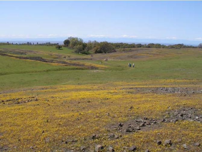
Table Mountain Ecological Reserve; photo courtesy of Esther Burkett.

the Reserve is planned for 9:30am; carpooling is strongly encouraged. Please RSVP to the event on our chapter Facebook page or email RSVP with any questions to Ona Alminas at chondestes44@gmail.com .